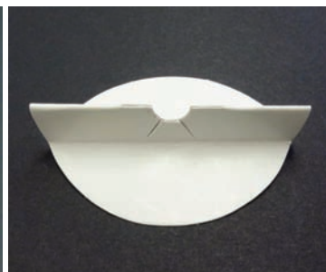
4. Glue center fold together.