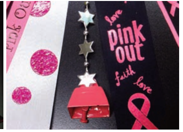
12. Add cowbells to the ends of the garlands or tie on with curling ribbon.