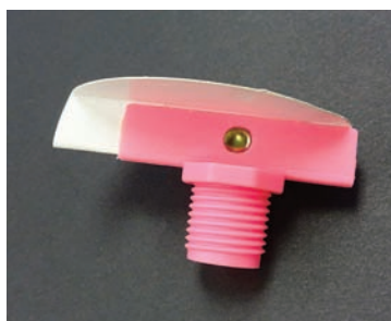
5. Glue to sign holder. Punch hole to add brad provided or use paper brad.