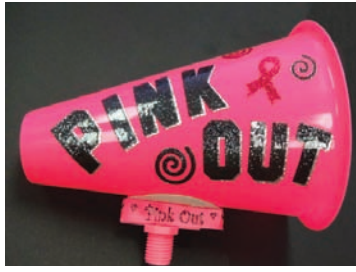
10. Add glitter stickers as shown. We covered the attachment piece with a #3 ribbon.