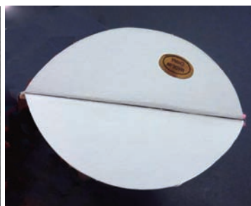
6. It will create a base to glue to the megaphone.