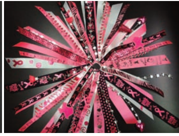
11. Add ribbons and garlands to the clear disc.