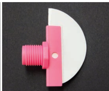
2. Slide into sign holder.