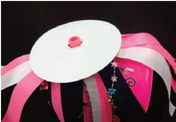
17. Fold the flaps in on the 6" paper disc and add to the threads to add volume to your spirit stick.