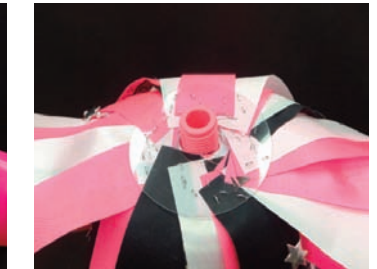
16. Flip ribbon disc over and add next.