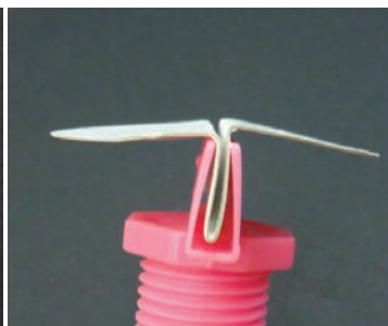
3. Fold edges down as shown.