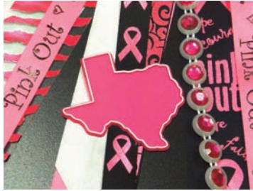
14. Glue flat trinkets to the ribbons.