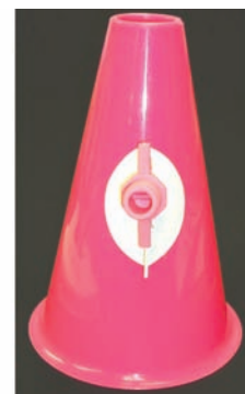
8. Glue to the side of the megaphone and press firmly until glue is set.