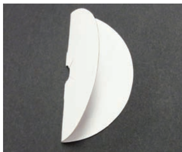
1. Fold 3" paper disc in half.