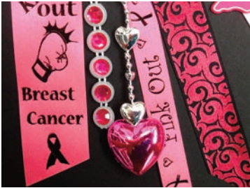
13. Add hearts to the ends of the garlands as well.