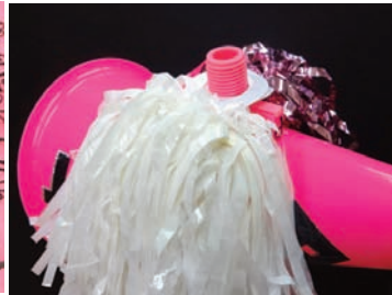
15. Hold megaphone with threads up and add mini poms.