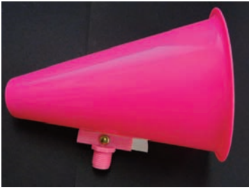
9. Now it's ready to embellish.